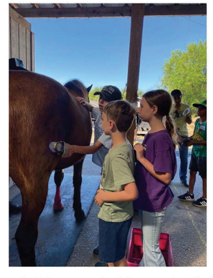
8:30am - 2:00pm daily

Activities include grooming, groundwork, leading and lunging, games, horse care, herd dynamics and horse related craft activities. Skill demonstrations every Friday.z