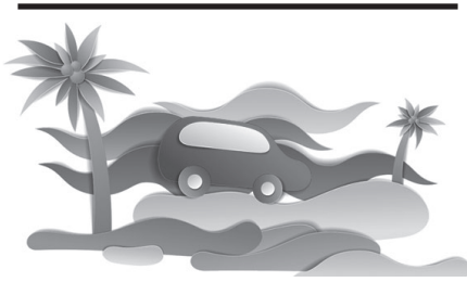
Field Manor 750 Field Manor Dr., Merritt Island

6/23, 10:30 a.m.-12 noon: Books, Balls & Blocks Child Screening event with Help Me Grow Brevard. Prizes available for families who complete the screening. Open to ages 0-5.